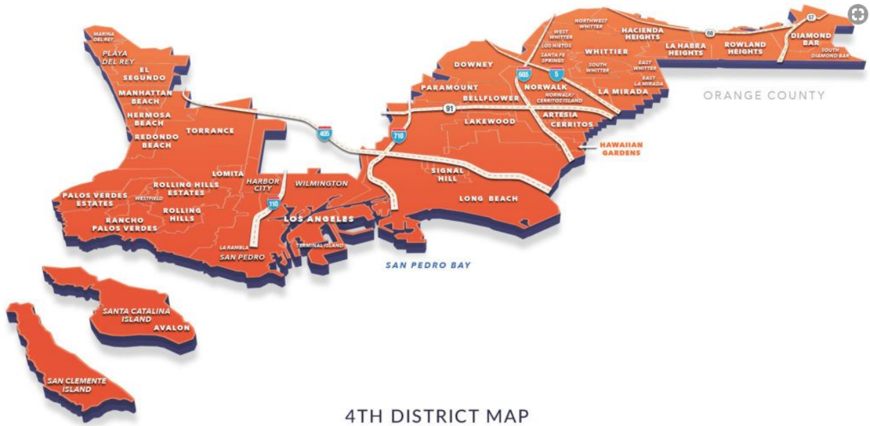
4TH DISTRICT MAP